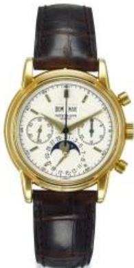
PATEK PHILIPPE. A PERPETUAL CALENDAR CHRONOGRAPH WRISTWATCH WITH MOON PHASES, REF. 2499/100

Important Private Collection of Number 1 Cartier Timepieces A Breguet made for King of Morocco Hassan II