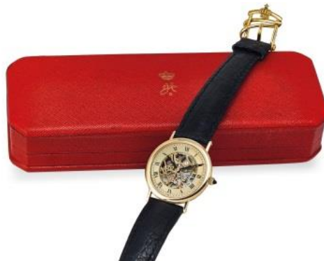
BREGUET. A SKELETONIZED WRISTWATCH WITH BOX. MADE FOR KING HASSAN II OF MOROCCO