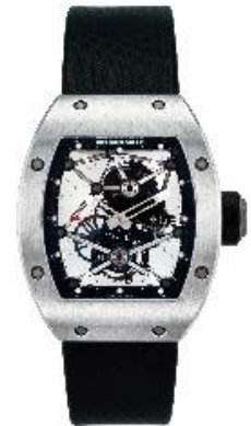
RICHARD MILLE. A PLATINUM LIMITED EDITION TONNEAU-SHAPED SKELETONIZED TOURBILLON WRISTWATCH. RM 12 AG PT